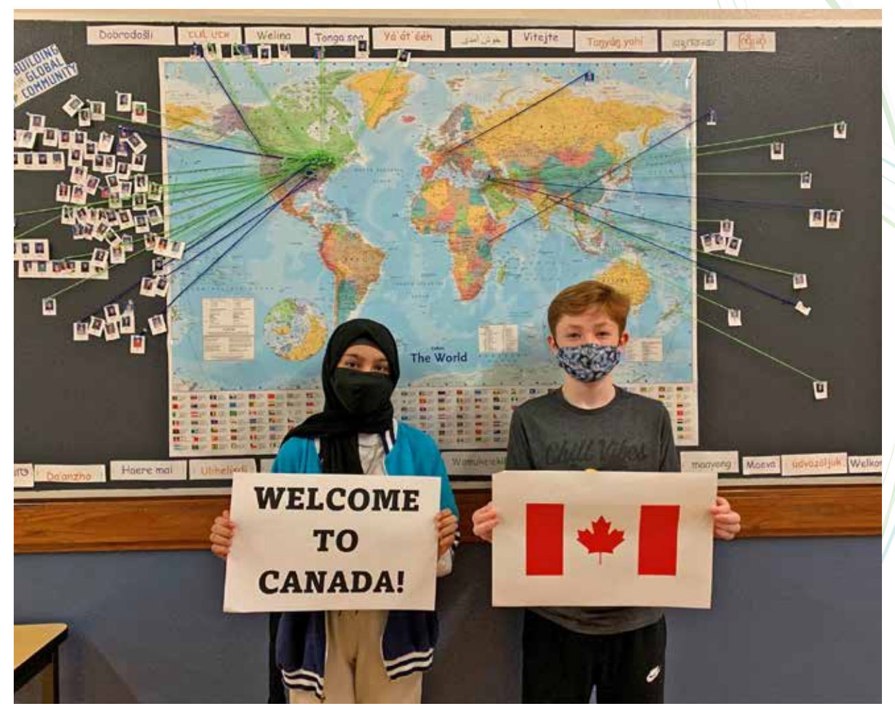
Students at Queen Mary Public School created thoughtful messages for each of the new arrivals from Afghanistan.

As a school community, Queen Mary students and staff believe in sharing positivity and spreading kindness each and every day! By supporting the NCC, students learned the importance of fostering caring and inclusive communities.