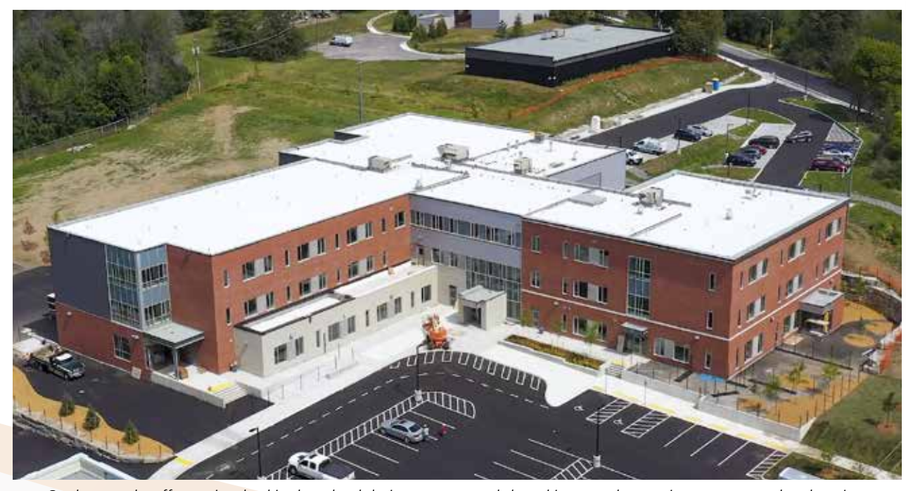
Students and staff were involved in the school design process, and shared input on how to incorporate modern learning, innovation and sustainability components.

While students and staff continue to enjoy learning together in their new school, an official Opening Celebration will take place at KECPS this spring!