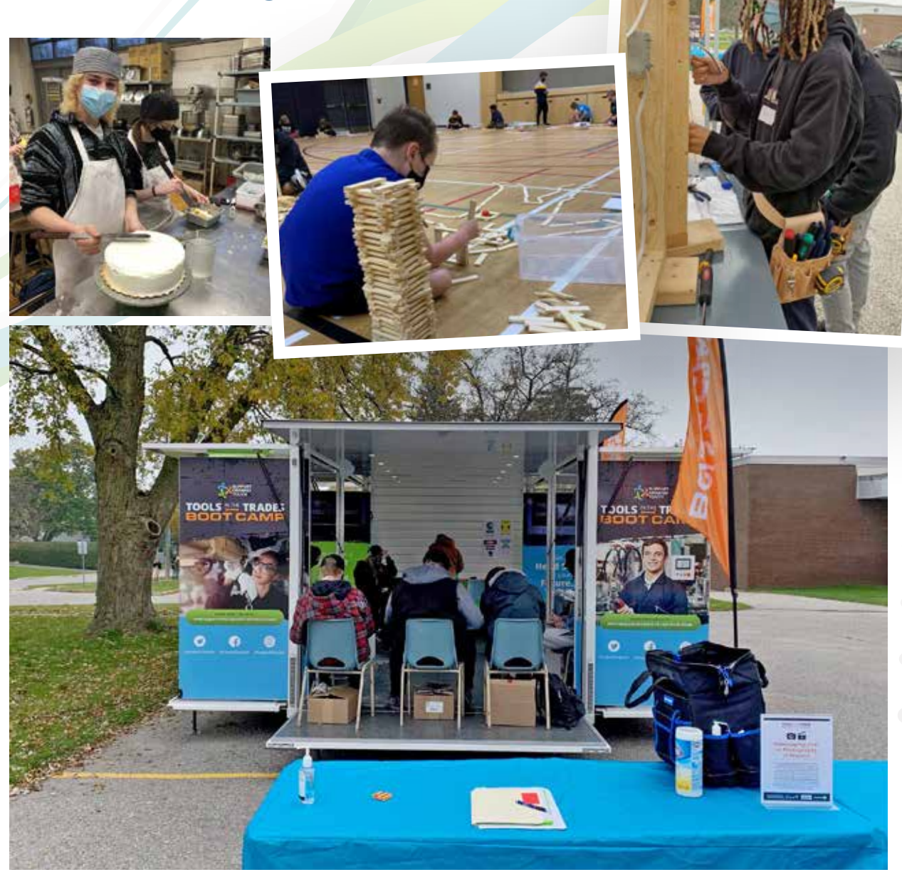
Interested students get hands-on experience working with trade professionals as well as career planning advice.