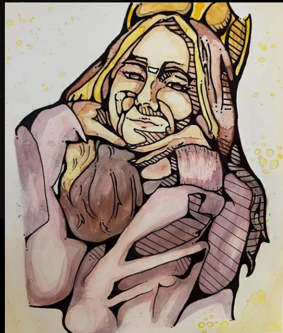
Neurographical Self Portraits