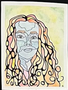
Neurographic Self Portrait