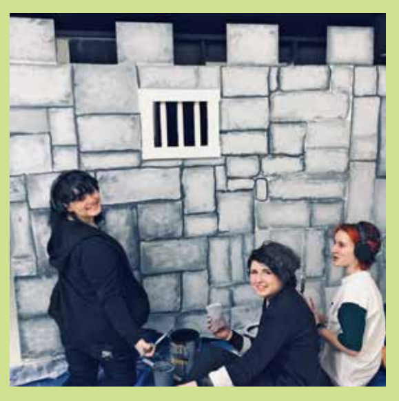
Thomas A. Stewart Secondary School students shared their artistic talents painting the set for the school's production of The Wizard of Oz.